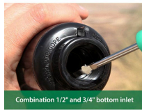
Combination 1/2" and 3/4" bottom inlet