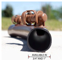
AVAILABLE IN 3/4" AND 1"